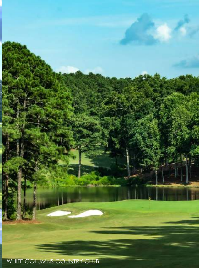
WHITE COLUMNS COUNTRY CLUB

Surrounded by lush pines and picturesque lakes, this Jack Nicklaus-designed course provides players with one of the most challenging layouts in the Atlanta area.