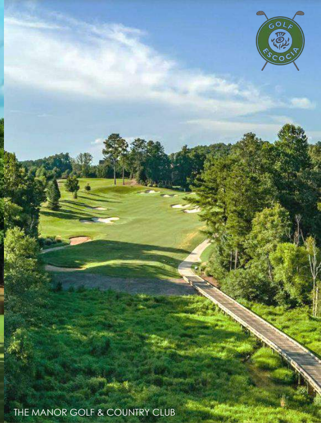
THE MANOR GOLF & COUNTRY CLUB

A championship golf course designed by world-renowned architect Tom Fazio. The course has a distinctly traditional feel and provides a true private club experience.