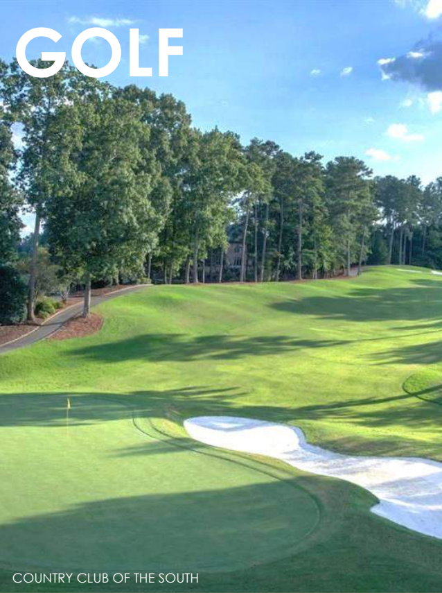
COUNTRY CLUB OF THE SOUTH

Surrounded by lush pines and picturesque lakes, this Jack Nicklaus-designed course provides players with one of the most challenging layouts in the Atlanta area.